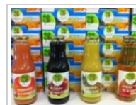
Pineapple juice popu