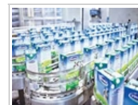
US grants FDA certif