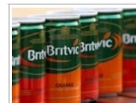
Revenues rise at sof